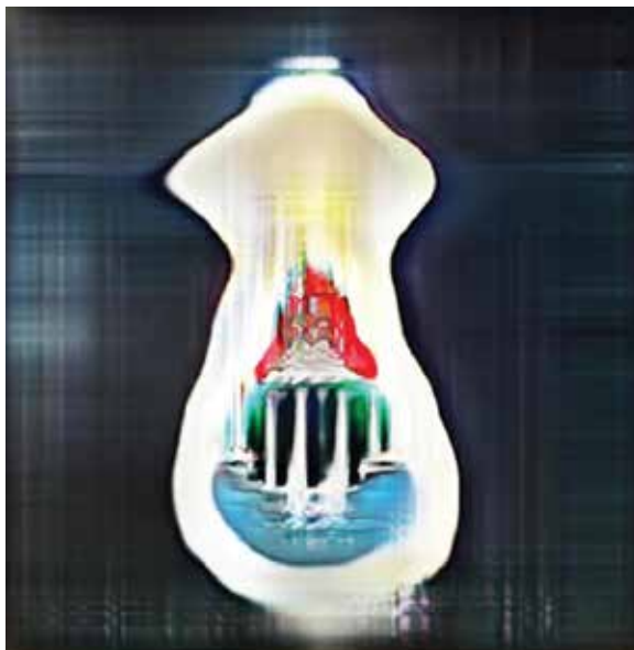
ABOVE: Wonderbread/Wish (2021), AI-generated digital image. LEFT: Joy + Dawn/Martha (2021), AI-generated digital image.